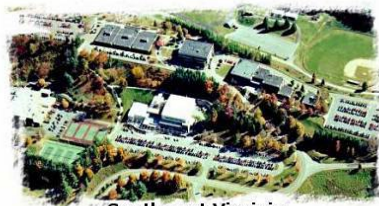
Southwest Virginia Community College